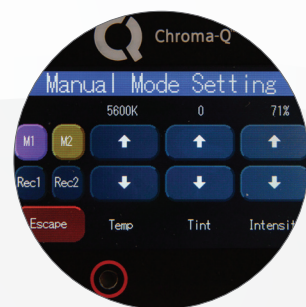
Colour touch screen interface and manual mode