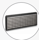
Egg crate louver