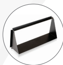
Half top hat