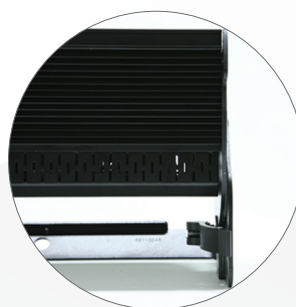
Hidden quick release fixings and flat end plates

The Studio Force Phosphor range's camera friendly custom optical design provides a smooth, uniform output, matched by theatrical grade dimming.