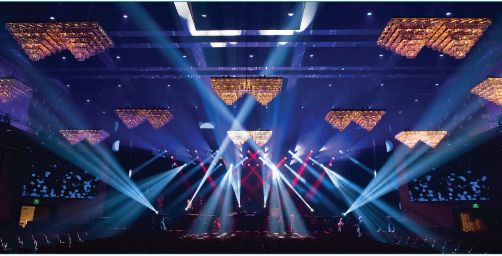
The room's automated lighting package draws heavily on Chauvet Professional's Maverick line.