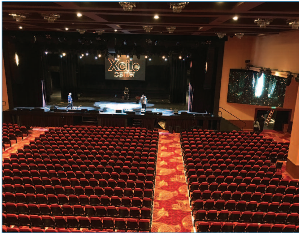
The sound system employs a Meyer Sound PA

Color Force II units, eight ETC Source Four LED Series 2 Tungsten HDs, four Robert Juliat Victor followspots, and