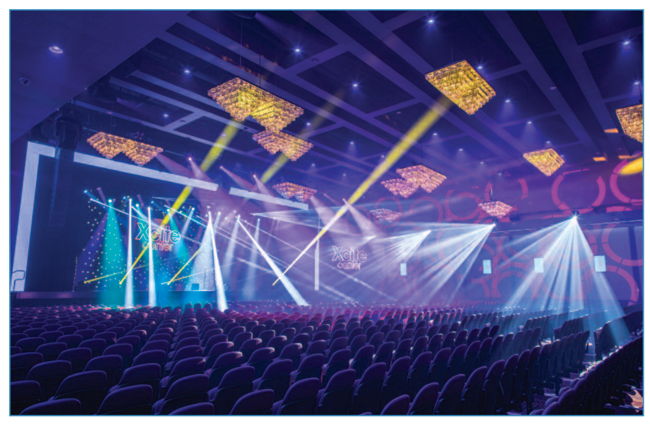
The room's chandeliers can be raised and lowered as needed, using an ETC QuickTouch controller.

design and Starlite worked with him in bringing it home. It was a big challenge getting all the networking requirements for in-house and touring acts' use as well as Internet access; ultimately, having a dedicated building-wide network was the most reliable and safest way to go. We couldn't even consider our systems having any access to the casino, because you definitely can't crash the slot machines."