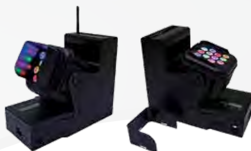
Shown with optional half hat snoot

The Color Charge can be floor mounted or hung from truss via M12 nutsert and safely secured in place via a built-in Kensington lock slot. For maximum practicality, the Color Charge can also be mains powered and controlled via wired DMX.