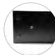
Built-in M12 Nutsert

For the latest news and information on the Chroma-Q range, visit www.chroma-q.com