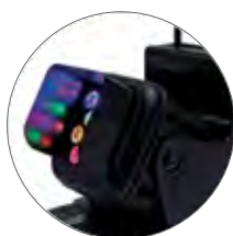
Optional Half Hat Snoot