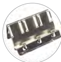
Optional Power Cradle