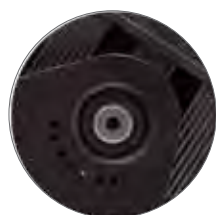
Stepped Beam Angles

*Magic Amber is the term used for the unit's ability to bring in amber when mixing colours that require it.