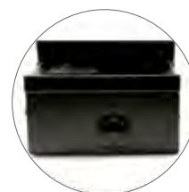
Built-in Mains Charger