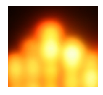
Fire effect using a diffusion screen