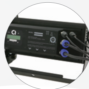
PowerCon and 5-pin DMX connections in and out

*Measurements may have been rounded, please see specification sheet for full measurements.