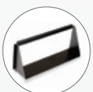
Half top hat