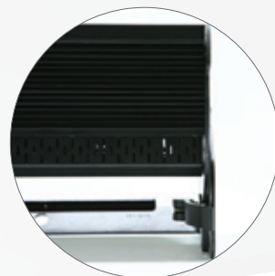
Hidden quick release fixings and flat end plates

On the outside, the Studio Force T 12 has been designed to provide maximum versatility and ease of use. The built-in power supply, hidden quick release fixings requiring no tools, and PowerCon and 5-pin DMX connections in and out provide fast deployment and simple cable management.