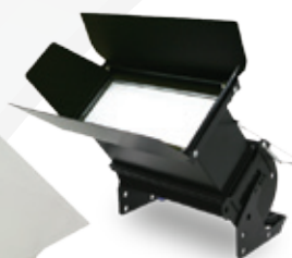
Diffuser box attachment**