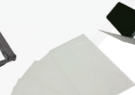
Cyc and border light lens