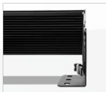
Hidden quick release fixings and flat end plates

The Studio Force V range also features stand-alone Master and Slave modes for additional usage possibilities, flat end plates for seamless wall-washing and a rugged extruded aluminium body.