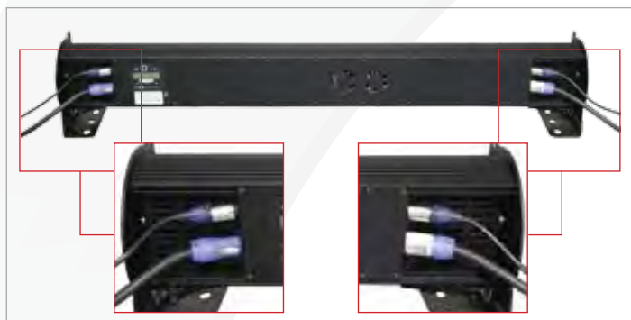
PowerCon and 5-pin DMX connections in at one end and out the other

The Studio Force V range's camera friendly custom optical design provides a smooth, uniform output, matched by theatrical grade dimming.