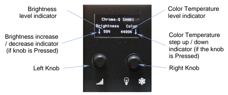
Fig. 2: Front Control Panel (Balanced Idle mode: both sides have same Brightness and CCT)

The CCT can be increased by rotating the Right knob clockwise, 50K each step. When the CCT increase / decrease indicator shows UP (†), the CCT will increase by 500K, when the knob is pressed.