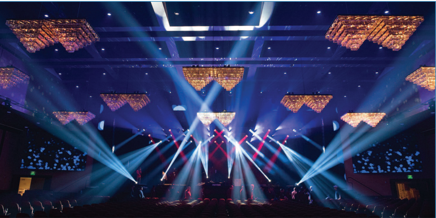
The room's automated lighting package draws heavily on Chauvet Professional's Maverick line.