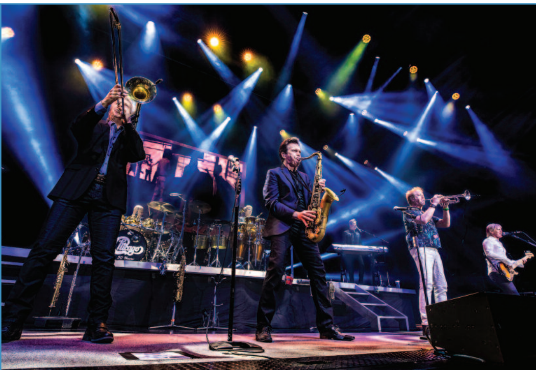
The room is designed to handle a wide variety of acts.