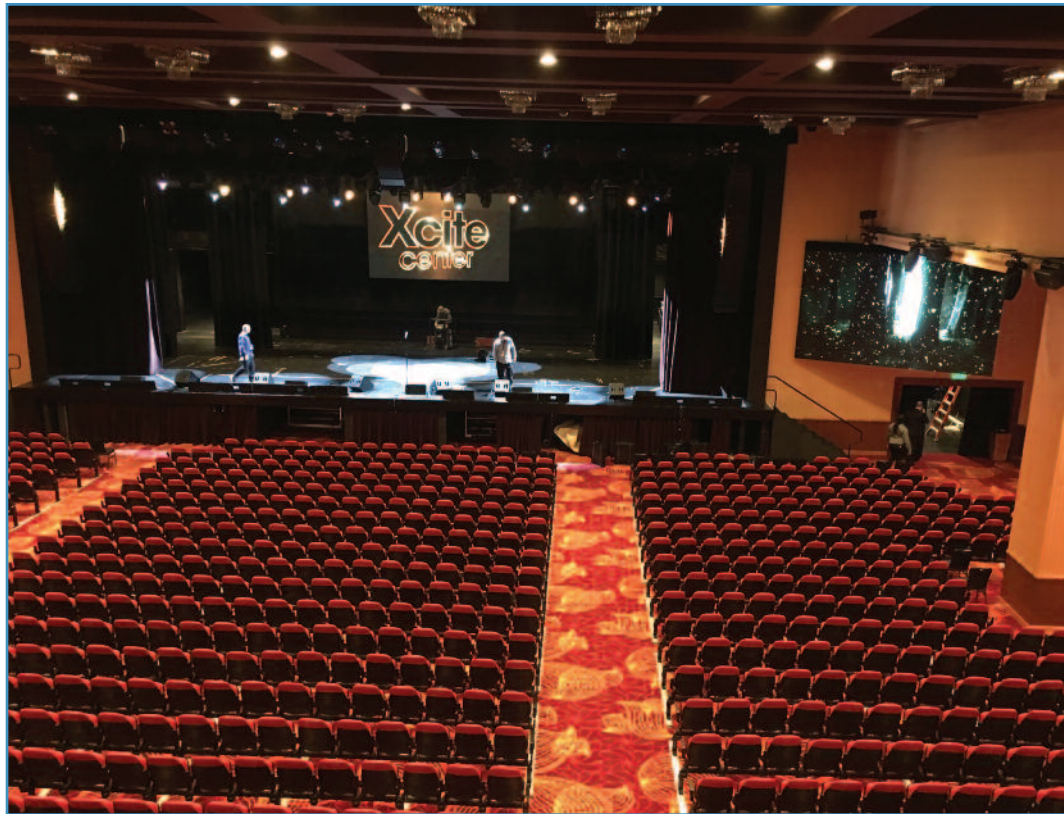
The sound system employs a Meyer Sound PA.

Color Force II units, eight ETC Source Four LED Series 2 Tungsten HDs, four Robert Juliat Victor followspots, and