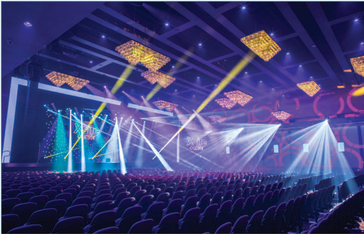
The room's chandeliers can be raised and lowered as needed, using an ETC QuickTouch controller.

design and Starlite worked with him in bringing it home. It was a big challenge getting all the networking requirements for in-house and touring acts' use as well as Internet access; ultimately, having a dedicated building-wide network was the most reliable and safest way to go. We couldn't even consider our systems having any access to the casino, because you definitely can't crash the slot machines."